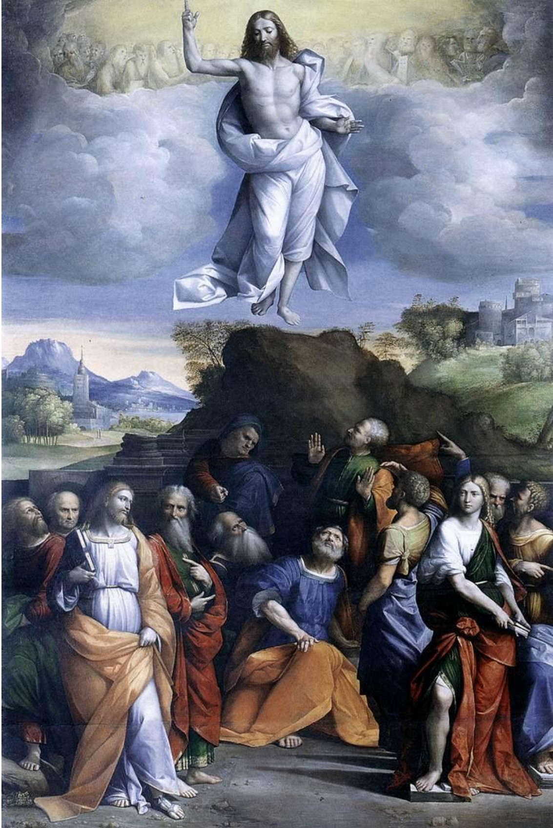
“Ascension of Christ”