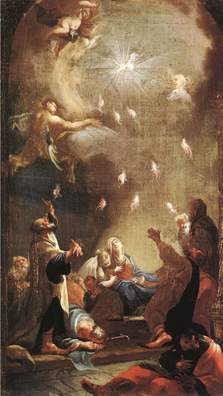
“Pentecost” Joseph Mildorfer 1750s