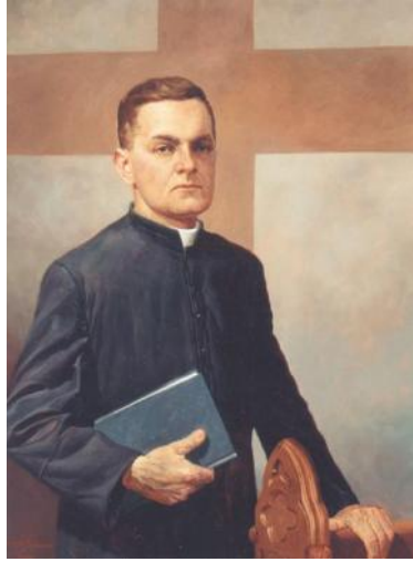
Father McGivney Pray for Us

Meetings are held on the 1st and 3rd Tuesdays of each month in the Council Hall located at the intersection of Morton Street and Garity Place. The mailing address is 1 Morton Street, Farmingdale, NY 11735-4340. The deadline for material for publication in the Mariner is the Friday that follows the 3rd Wednesday of the prior month. PLEASE keep this deadline in mind for articles you wish to have publish in the Mariner.