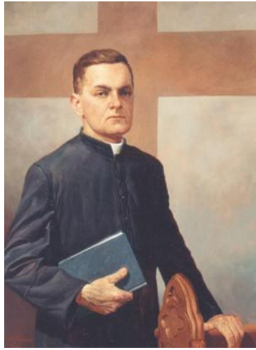
Father McGivney Pray for Us

Meetings are held on the 1st and 3rd Tuesdays of each month in the Council Hall located at the intersection of Morton Street and Garity Place. The mailing address is 1 Morton Street, Farmingdale, NY 11735-4340. The deadline for material for publication in the Mariner is the Friday that follows the 3rd Wednesday of the prior month. PLEASE keep this deadline in mind for articles you wish to have publish in the Mariner.