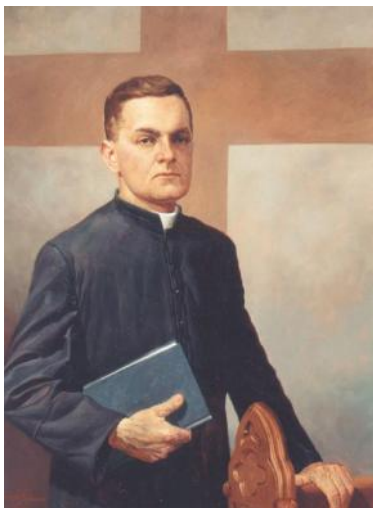
Father McGivney Pray for Us

Meetings are held on the 1st and 3rd Tuesdays of each month in the Council Hall located at the intersection of Morton Street and Garity Place. The mailing address is 1 Morton Street, Farmingdale, NY 11735-4340. The deadline for material for publication in the Mariner is the Friday that follows the 3rd Wednesday of the prior month. PLEASE keep this deadline in mind for articles you wish to have publish in the Mariner.