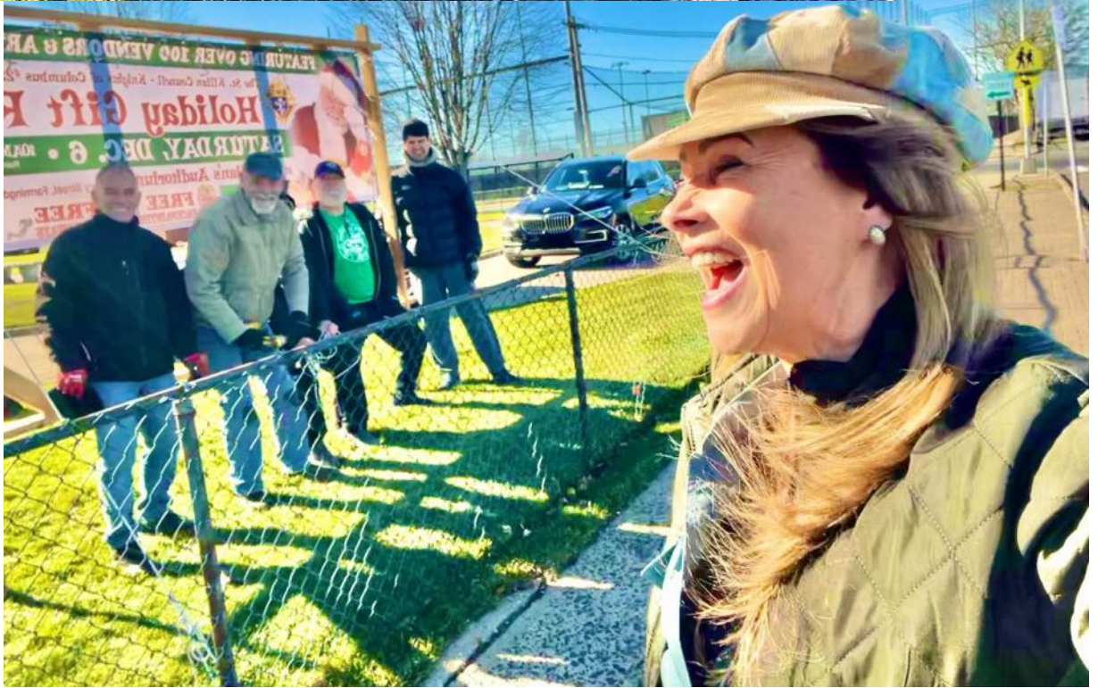
Knights from St Kilian Council (#2204) putting up the banner for the Christmas Gift Fair. It was later replaced with the “Keep Christ in Christmas” banner.