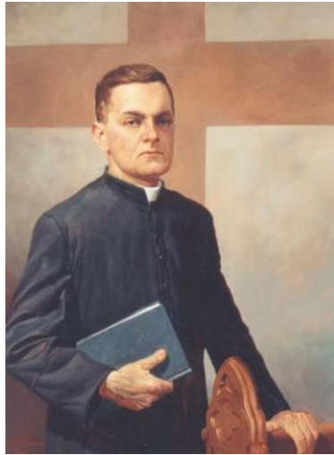
Father McGivney Pray for Us

Meetings are held on the 1st and 3rd Tuesdays of each month in the Council Hall located at the intersection of Morton Street and Garity Place. The mailing address is 1 Morton Street, Farmingdale, NY 11735-4340. The deadline for material for publication in the Mariner is the Friday that follows the 3rd Wednesday of the prior month. PLEASE keep this deadline in mind for articles you wish to have publish in the Mariner.