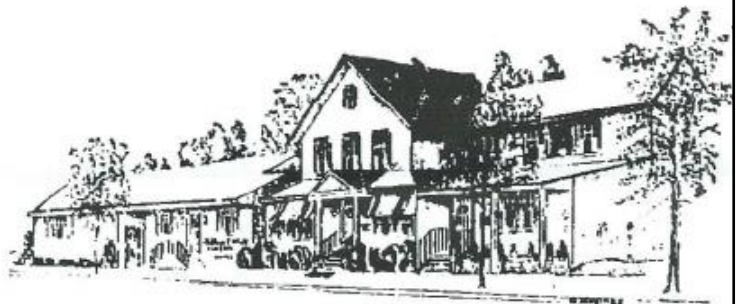
Farmingdale (Main Office) 315 Conklin Street, Farmingdale (516) 249-0336

Proud members of both Farmingdale & Bethpage Chambers of Commerce and Historical Societies, Farmingdale Rotary Club, St. Kilian Women's Guild, Farmingdale Junior League and the Knights of Columbus.