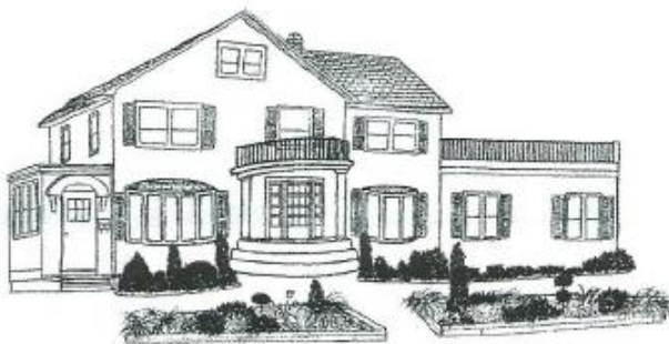
Bethpage 234 Broadway, Bethpage (516) 931-1454