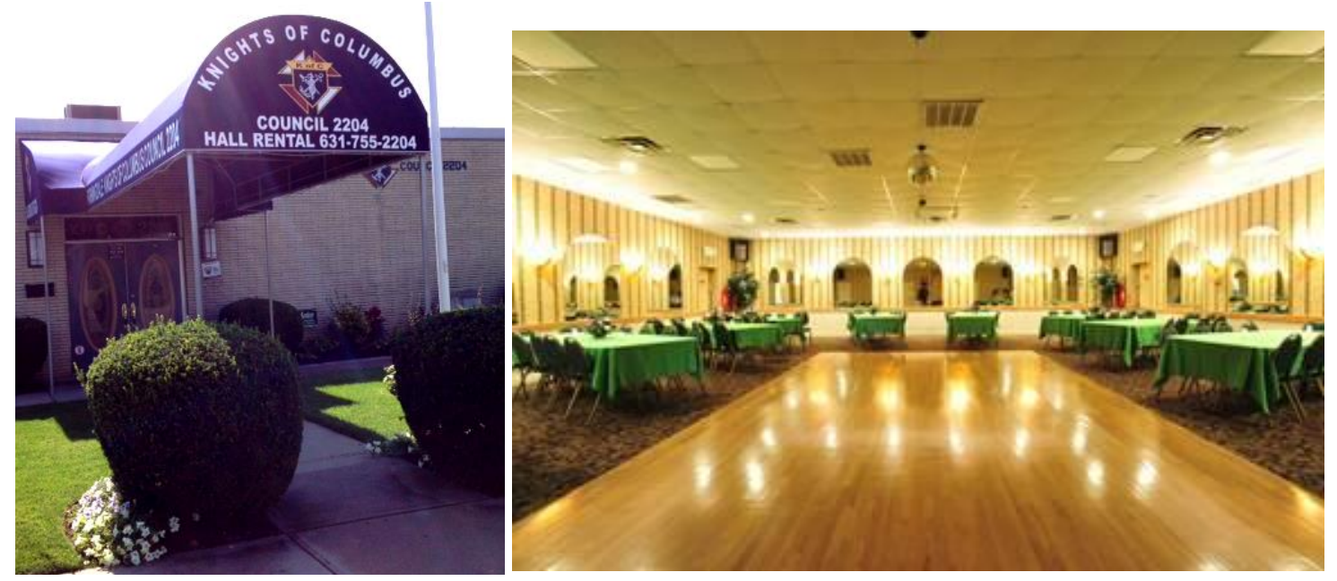
Looking for a place to host a birthday party or a first Communion or just getting the family together to have a good time? Our Farmingdale Catholic Center hall is available for rentals all year round. With a cozy atmosphere, stylish decor, seating for 120, and convenient location just off Route 109, we have everything your party needs.