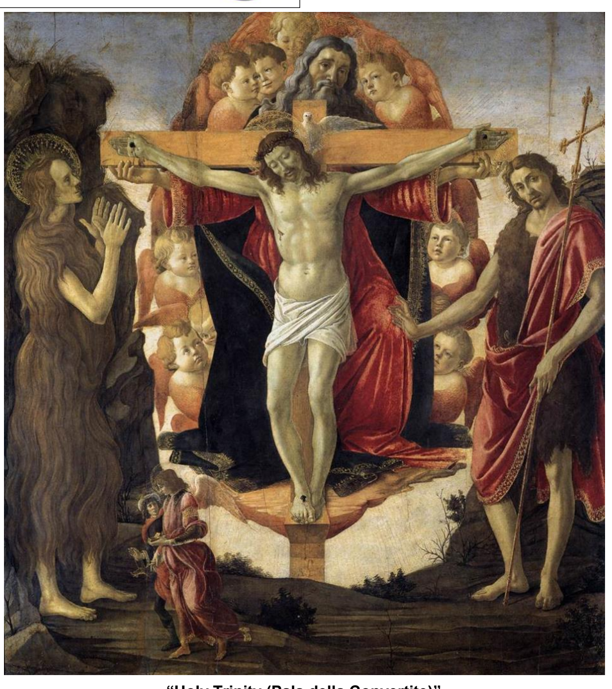
"Holy Trinity (Pala della Convertite)" Sandro Botticelli, 1491-93