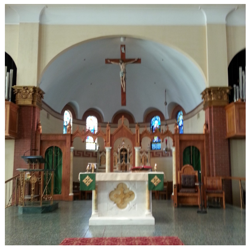
St. Kilian Church—Present Time