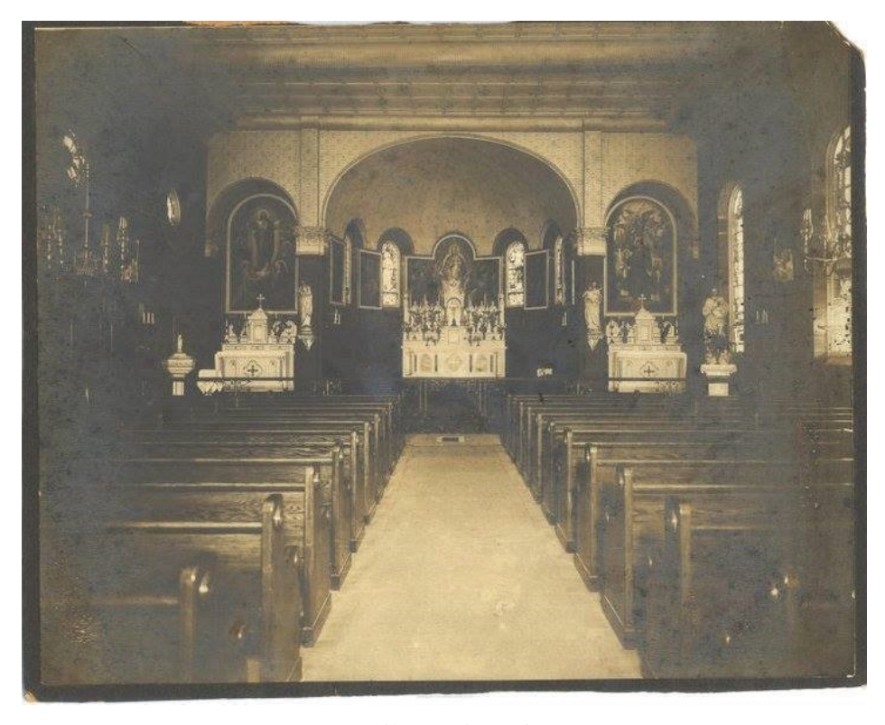
St. Kilian Church—1902