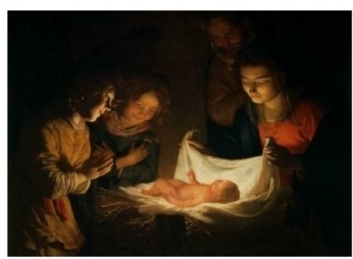
Adoration of the Child By Gerrit van Honthorst (c. 1620) Galleria degli Uffizi, Florence