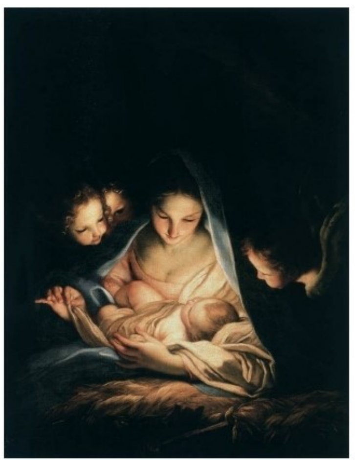
The Holy Night (The Nativity) By Carlo Maratti (1650s) Gemäldegalerie, Dresden

"The light shines in the darkness and the darkness has not overcome it" (John 1:5)