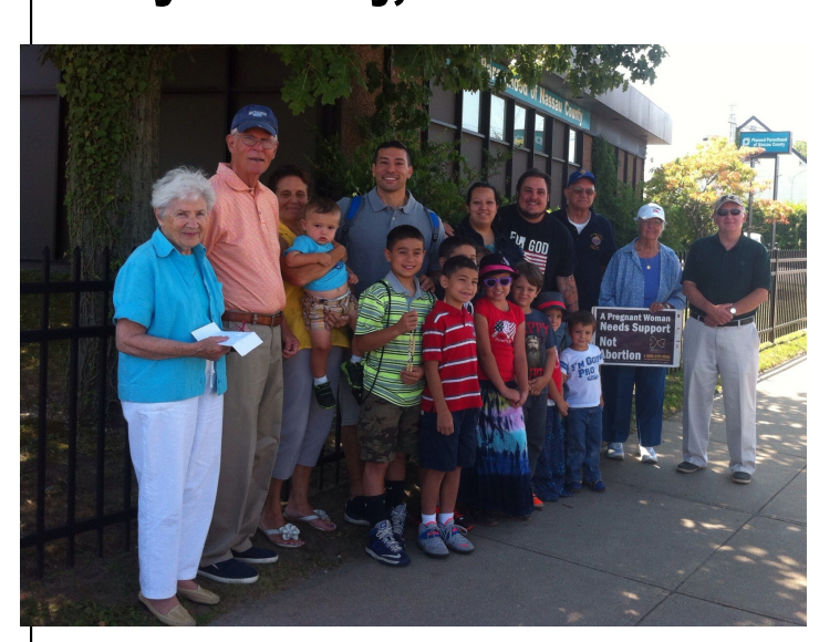
Pray For the Babies & an END to Abortion Outside of the Massapequa Planned Parenthood (35 Carmans Road –across from the Westfield Mall)

JOIN US AT OUR WEEKLY PRO-LIFE PRAYER VIGIL Every Saturday, 10:30AM-11:30AM