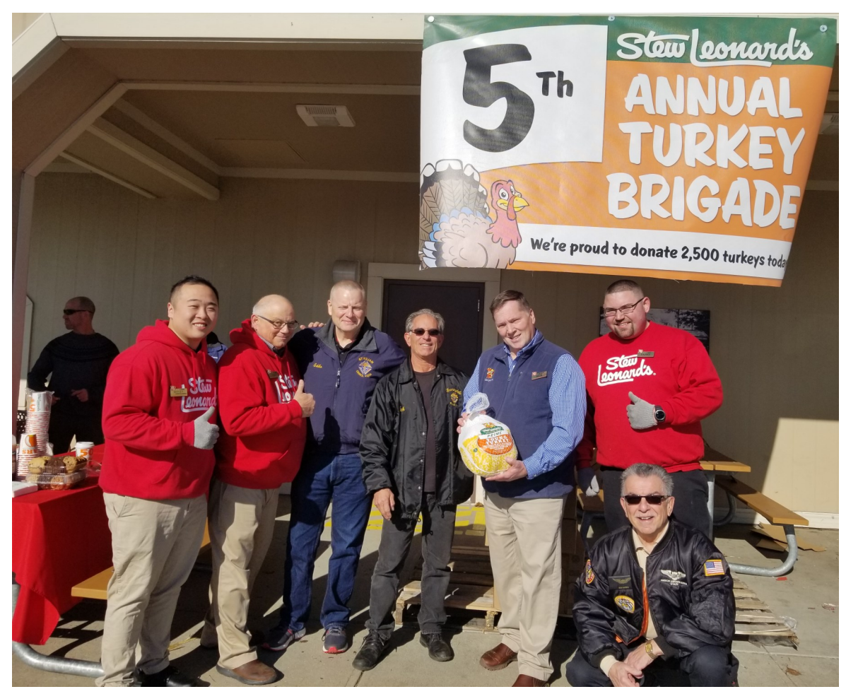
Knights in action Maybe can post them in the mariner 4 December giving away turkeys.